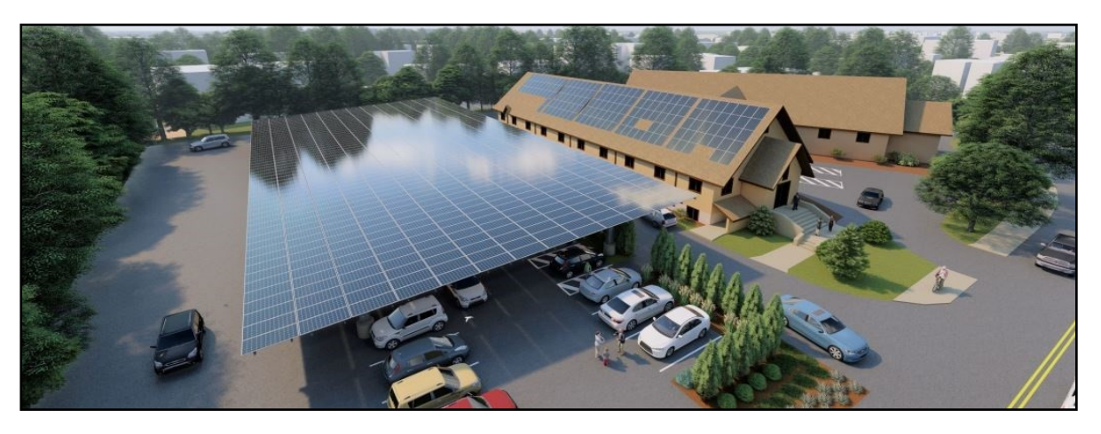
Our newly installed solar canopy

Budgeted operating income for 2024 is just over $400,000, and a signal in the confidence of our finances to call a full-time rector. While our draw on the endowment has been larger than we would like, we understand the need for both investing in our growth efforts as well as continued financial vigilance as we face the coming years. We are fortunate to have an endowment with just over $1.3 million dollars. We recognize that oversized dependence on the endowment is not sustainable. The vestry has earmarked church growth as a critical area for St. Andrew's worthy of bold investment.